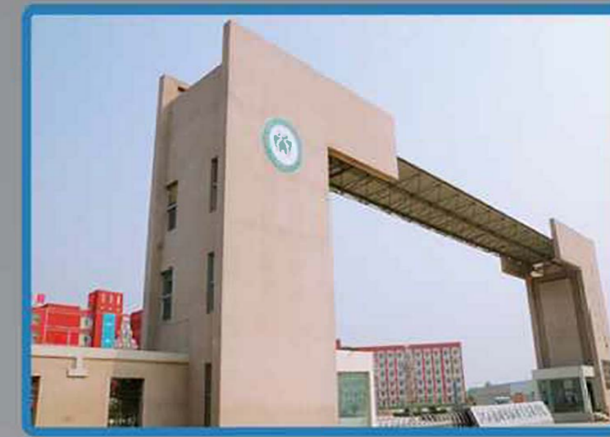
Networked Security: School