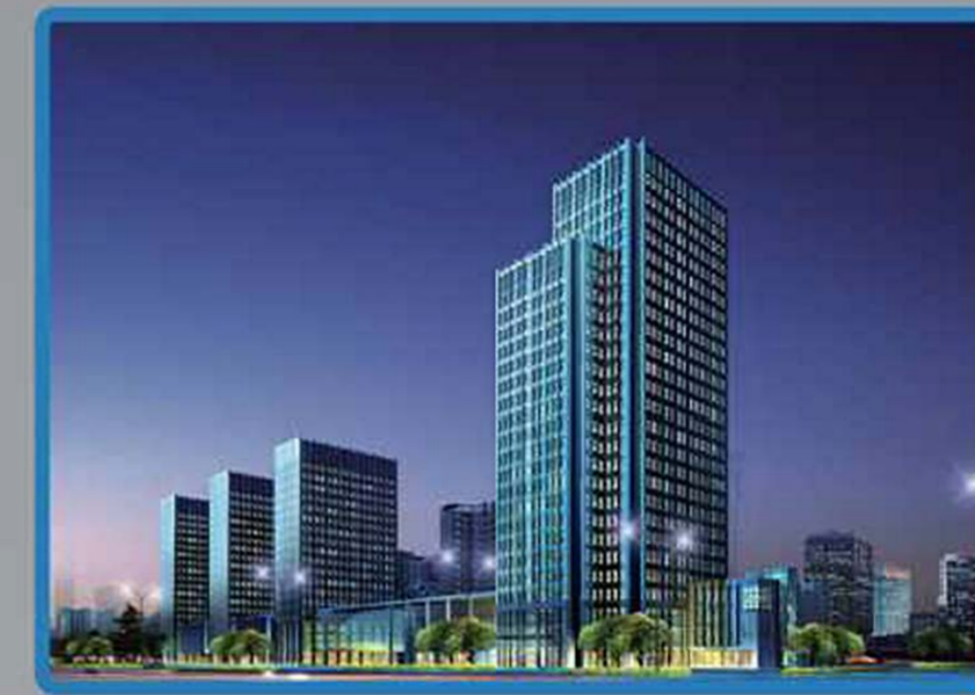
Networked Security: Building