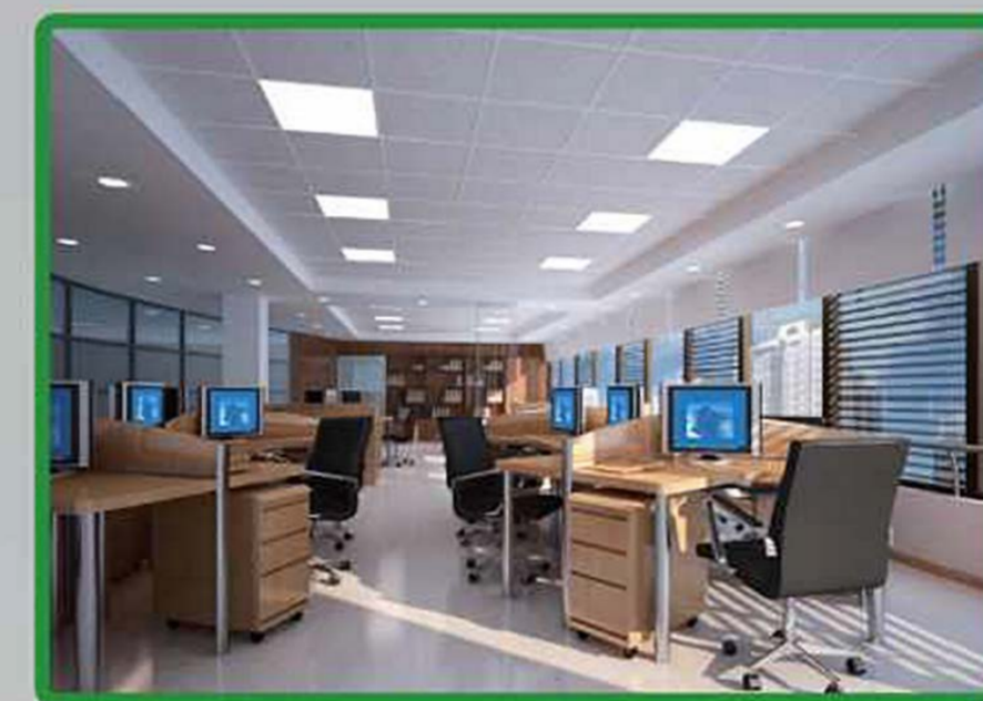
Time Attendance: Office