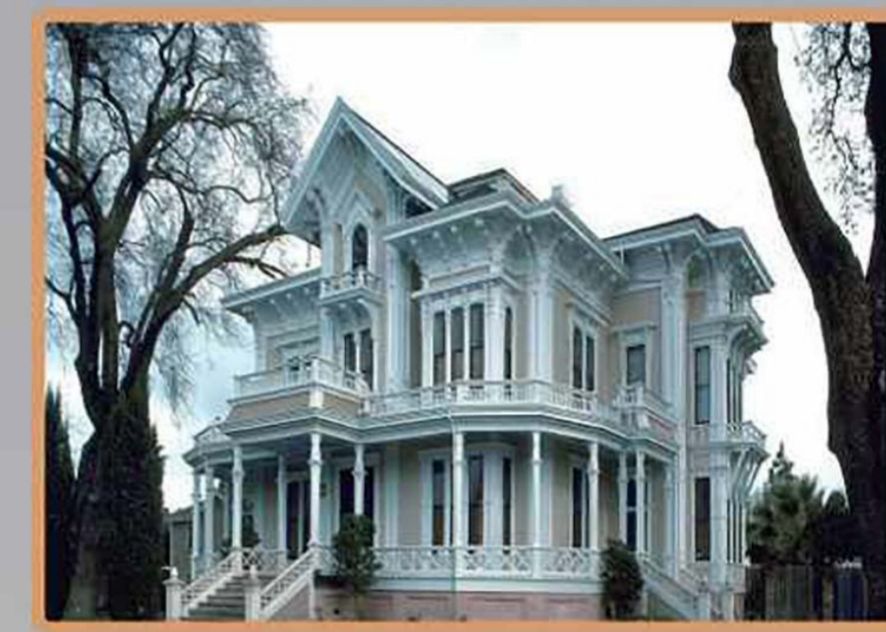
Standalone Access Control: House