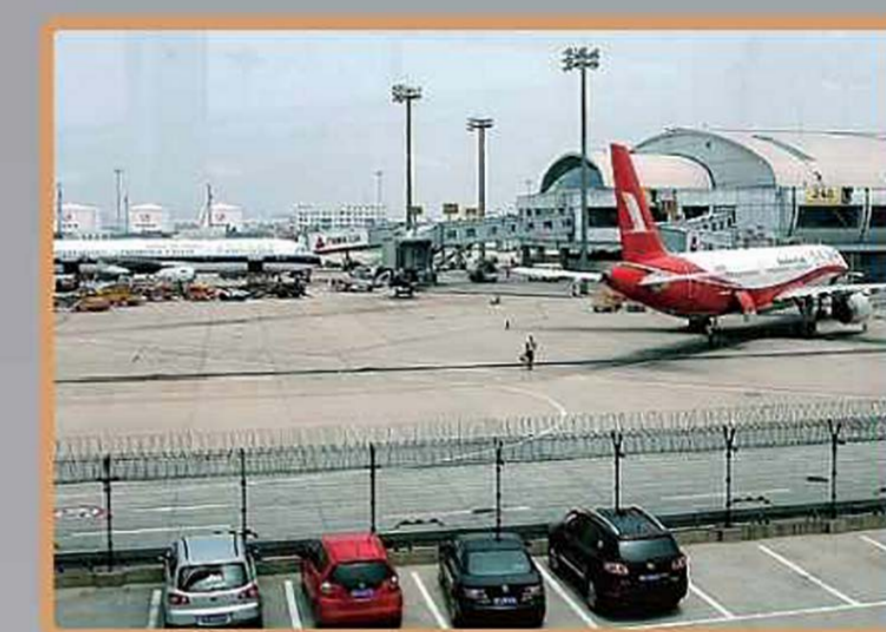
Standalone Access Control: Airport