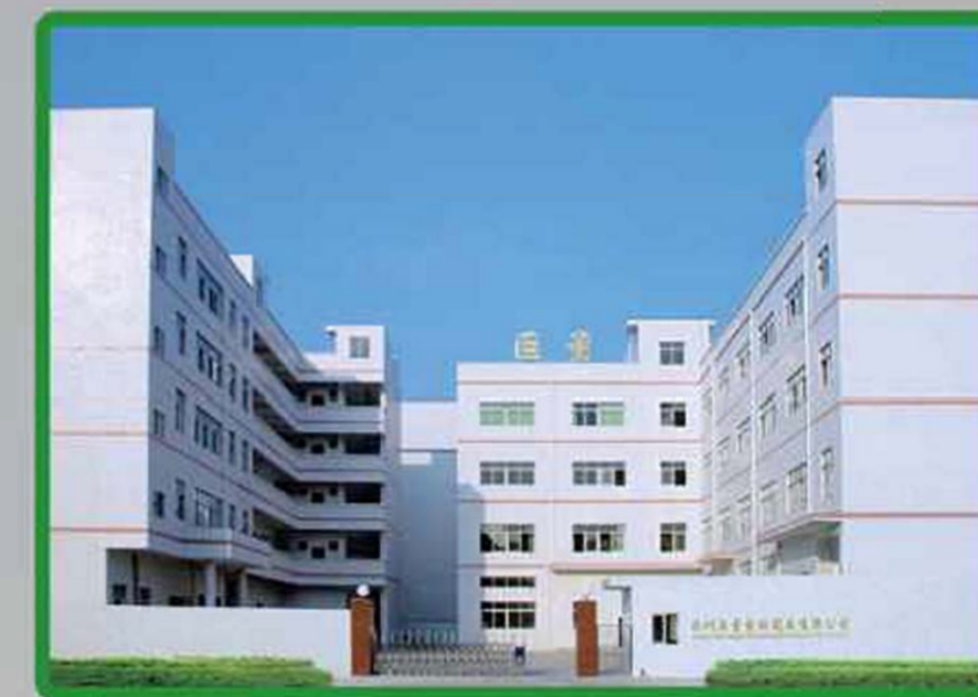
Time Attendance: Factory