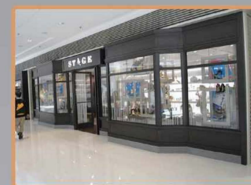
Standalone Access Control: Shop