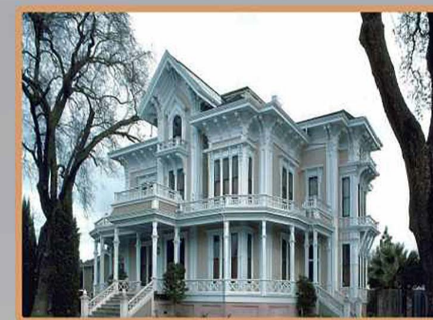
Standalone Access Control: House