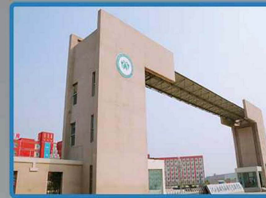
Networked Security: School