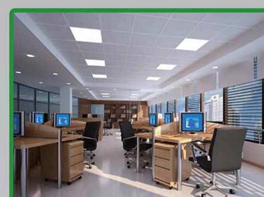
Time Attendance: Office

CA Your Trusted Security Service Provider Tel: +65 6748 1155