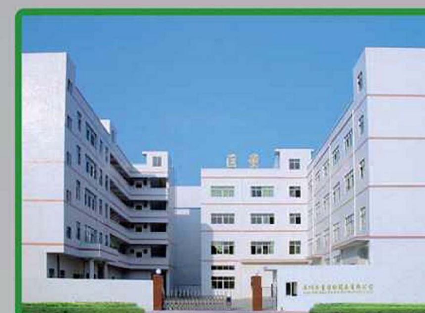
Time Attendance: Factory