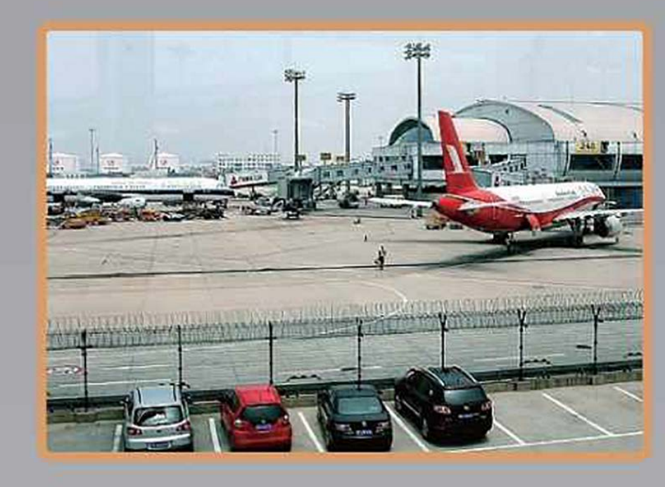
Standalone Access Control: Airport