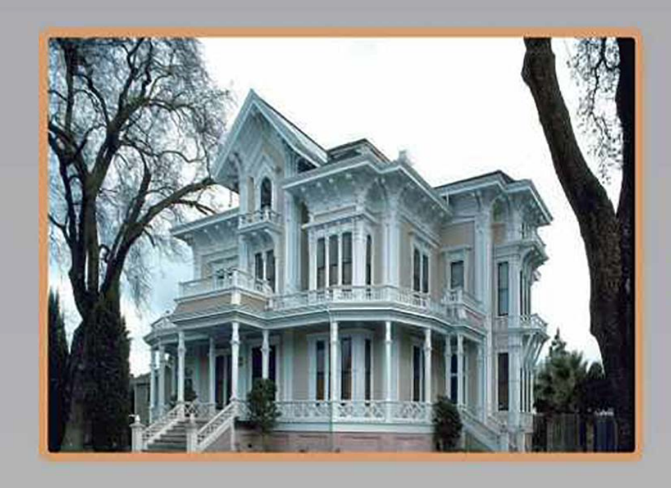
Standalone Access Control: House