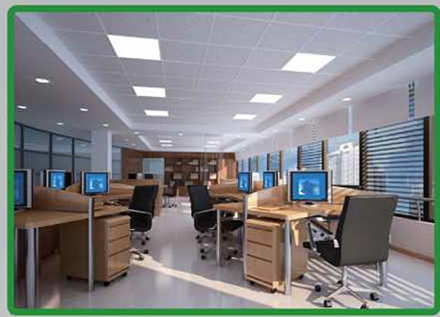
Time Attendance: Office