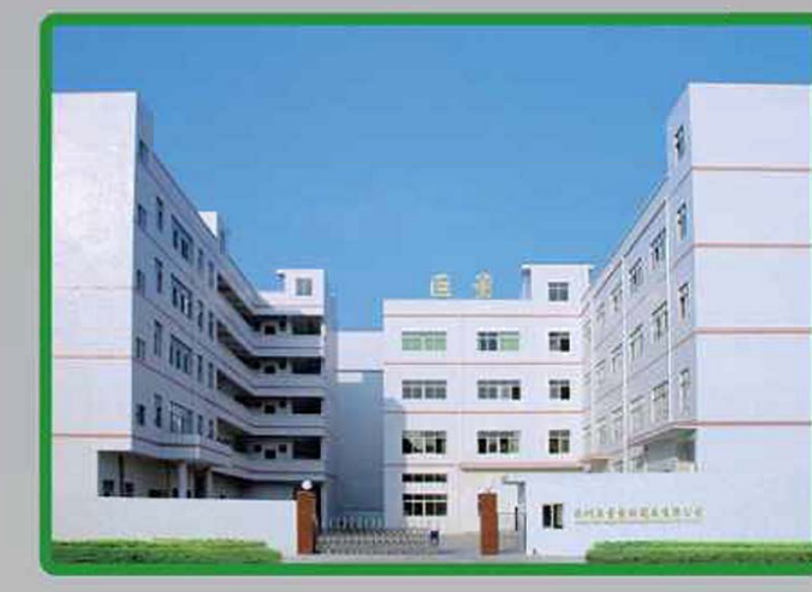
Time Attendance: Factory