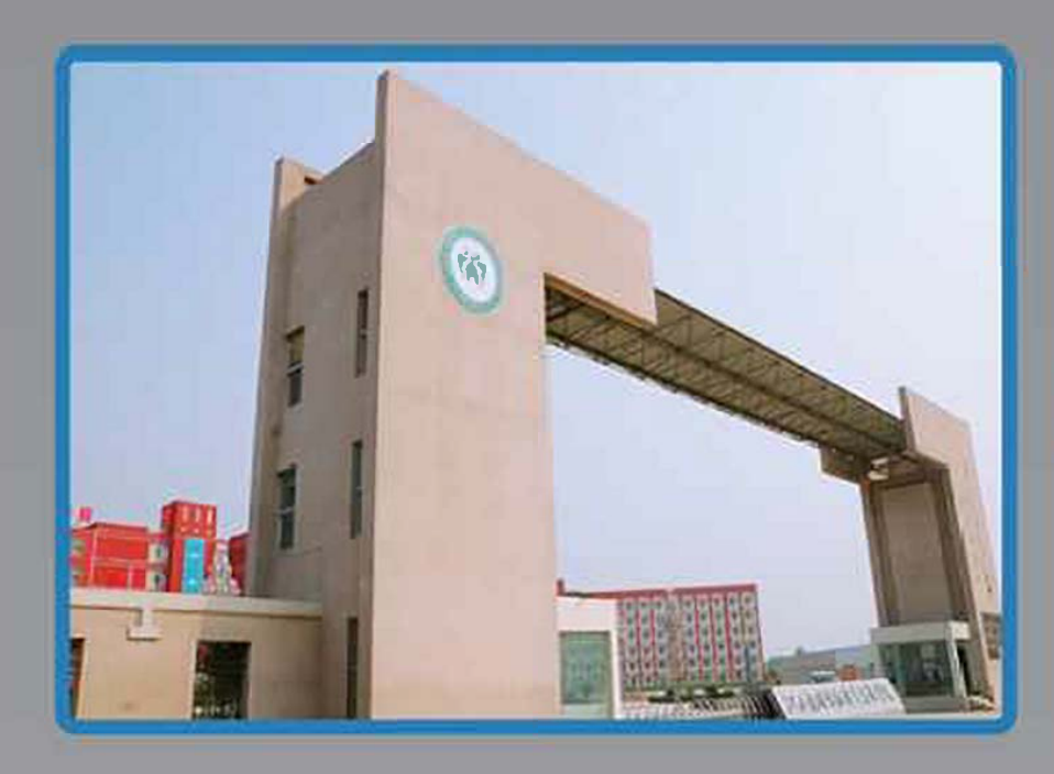
Networked Security: School