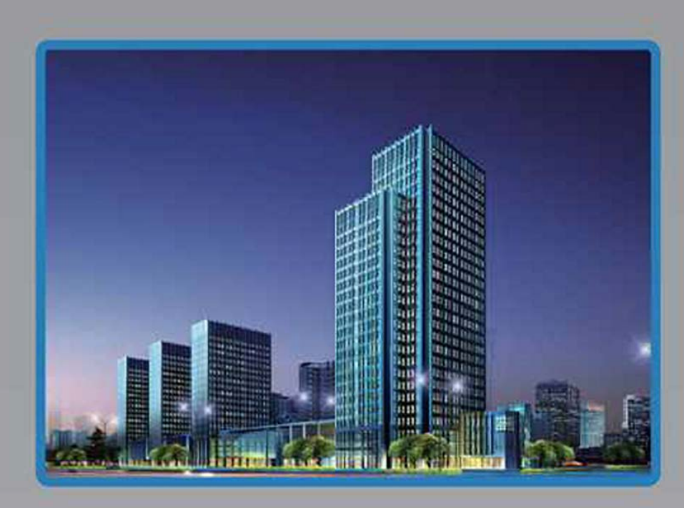
Networked Security: Building